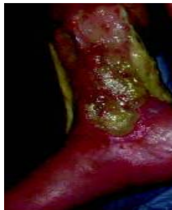
Angiogenesis (Red patches)