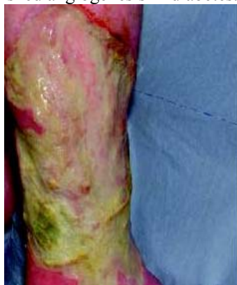
Diabetic Foot with poor angiogenesis

occurring in impaired wound healing including ulcers [16, 17]. Limited penetration of new blood vessels into the wound would restrict entry of inflammatory cells, as has been reported. In turn, the total amount of factors released by these cells will be decreased. The oxygen supply to the wound will also be poor. Topical administration of high glucose to wounds of non-diabetic rats resulted in inhibition of the normal angiogenic process [18], suggesting a direct role for high glucose levels in diminished angiogenesis in diabetes.