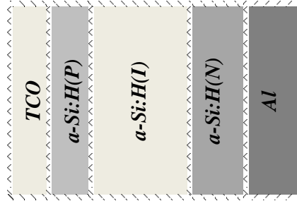
Fig. 1. a-Si:H solar cell.

Fig. 1 shows the structure of the cell used in the simulation. The structure is composed of a glass window, a transparent conductor oxide (TCO) anode, a P-I-N junction and a Al cathode. The input set used in our simulation is reported in Table 1.